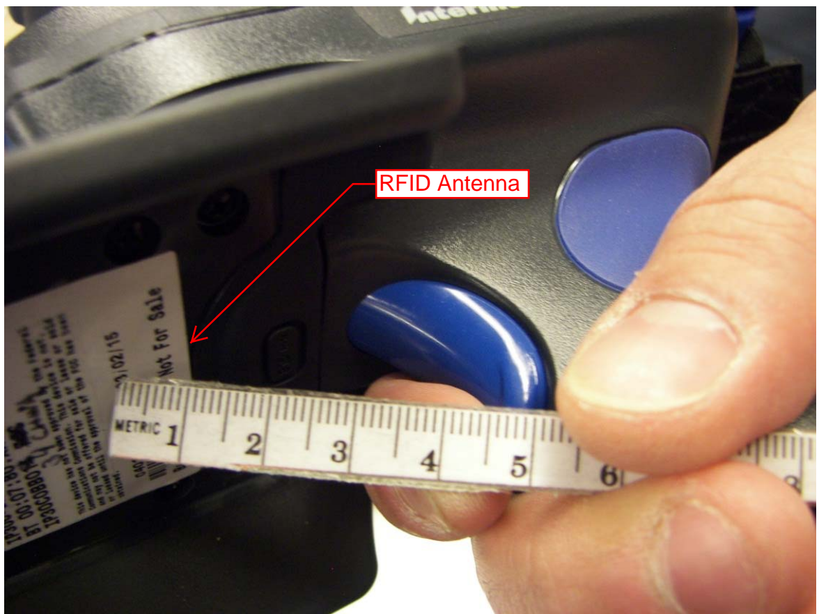
Separation distance = 3.0 cm