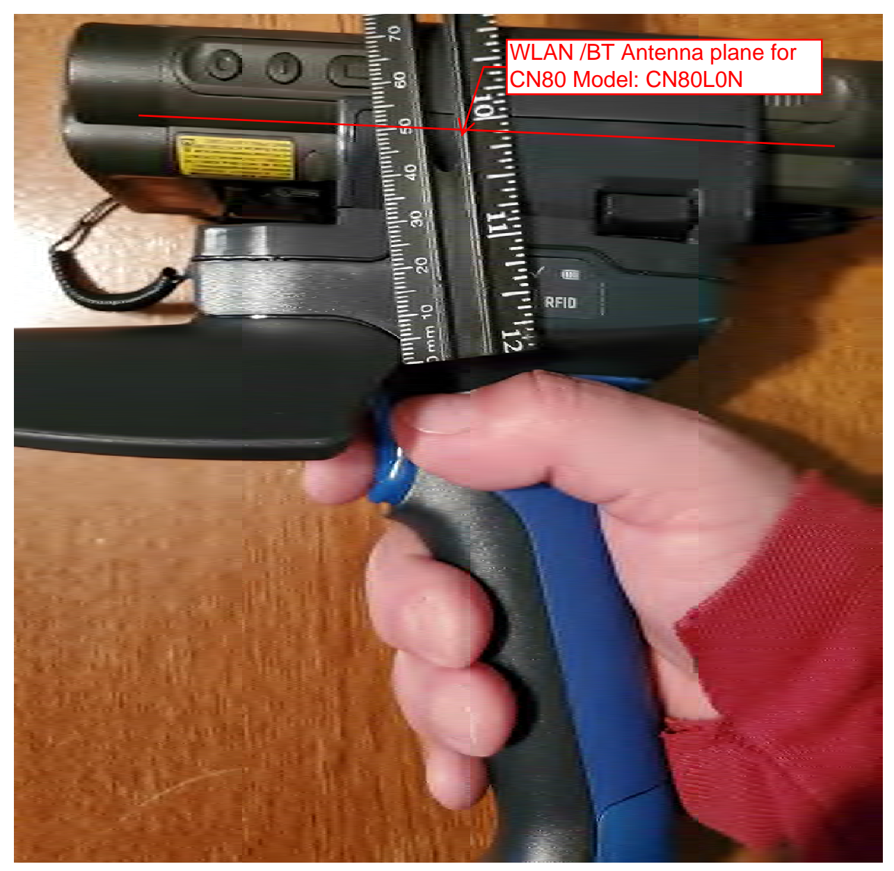
Separation distance = 5.0 cm