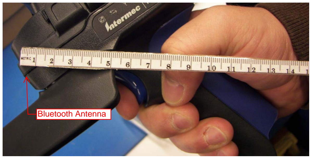
Separation distance = 5.2 cm