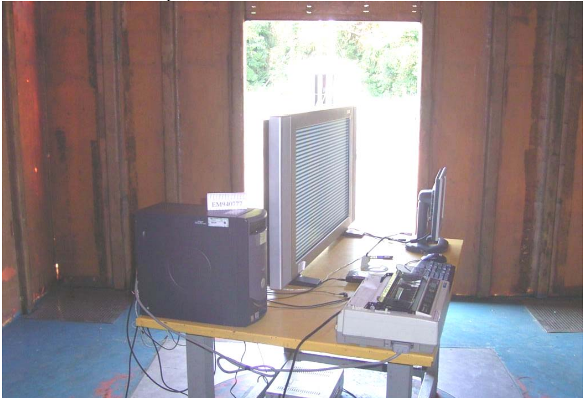
SETUP WITH MAXIMUM DETECTED EMISSION AT HORIZONTAL POLARIZATION

Test Mode: DVI Input, 1360*768/60Hz, 48kHz