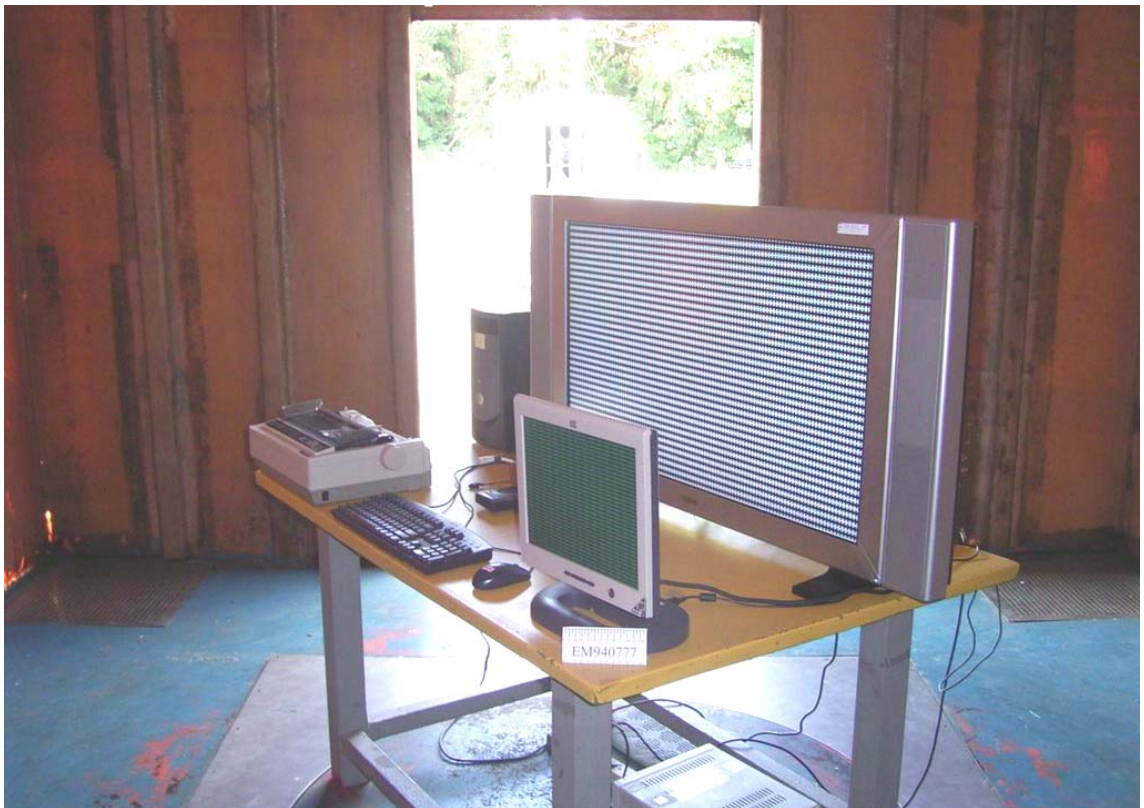
SETUP WITH MAXIMUM DETECTED EMISSION AT VERTICAL POLARIZATION