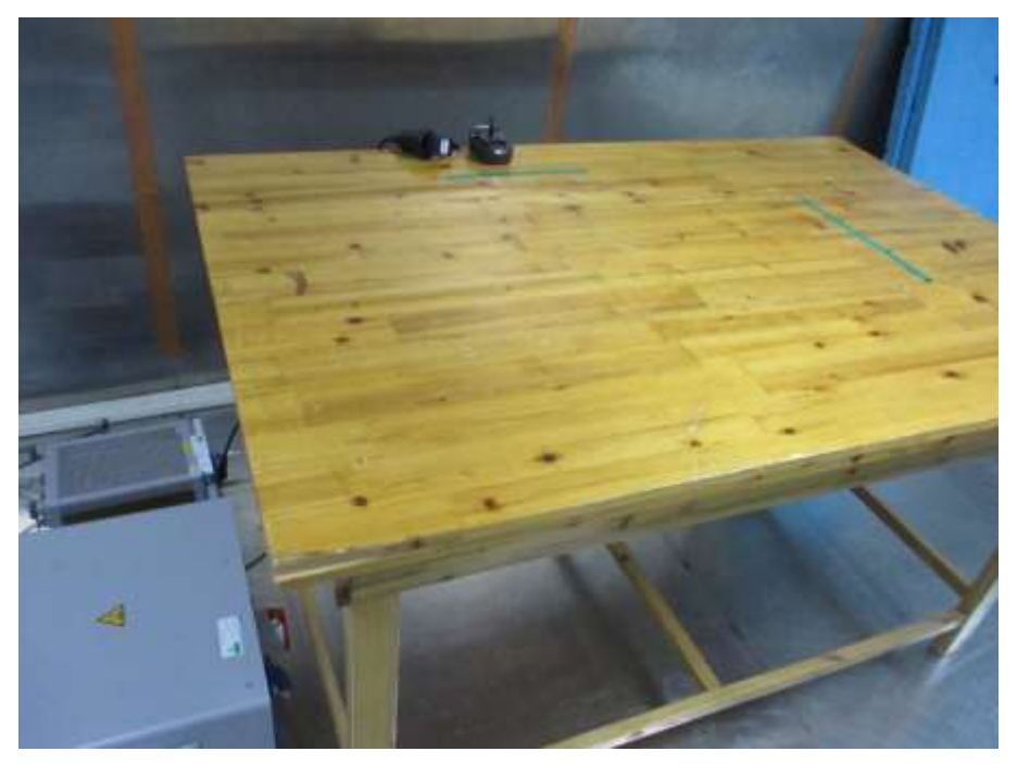
Photograph 2: Set-up for measurement of radiated emission