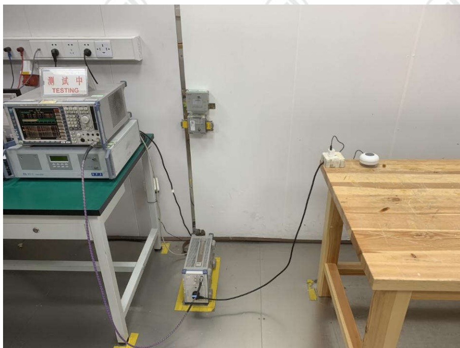
CONDUCTED EMISSION TEST SETUP