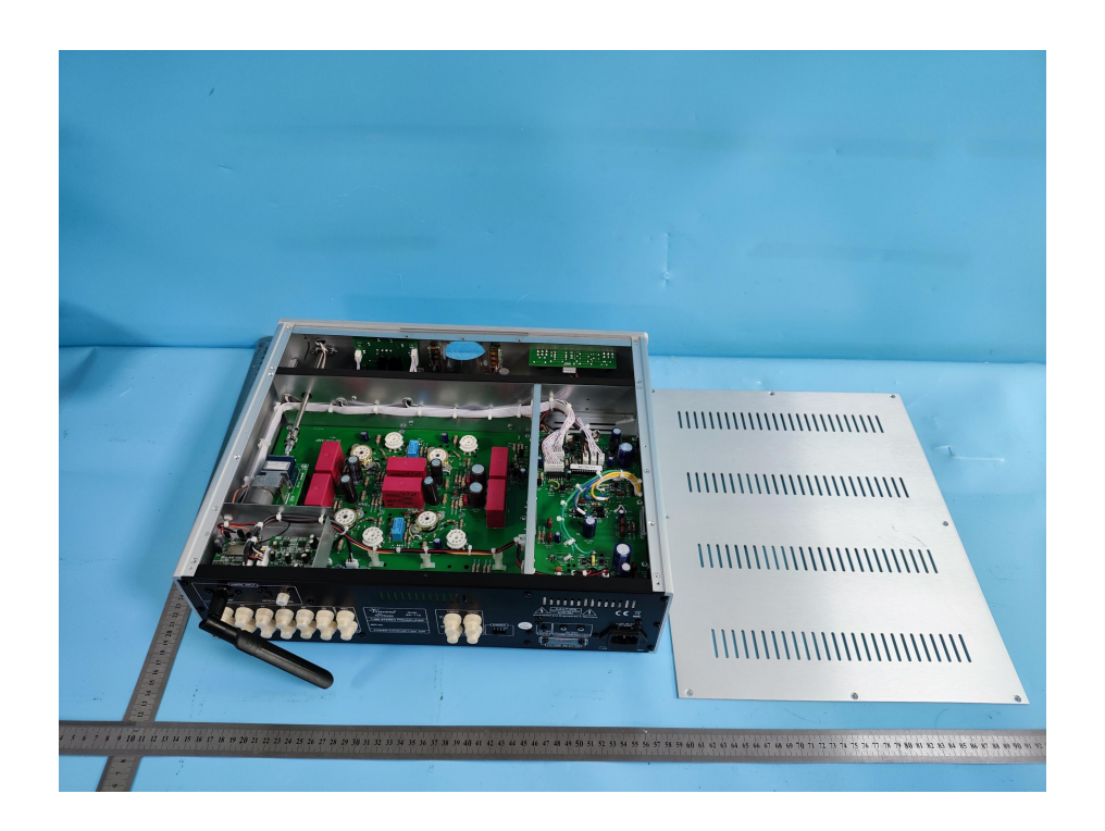
INTERNAL PHOTO OF SAMPLE