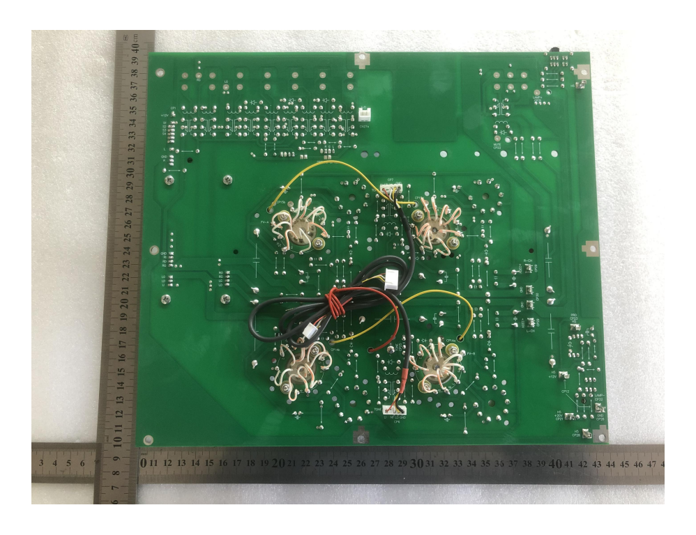
INTERNAL PHOTO OF SAMPLE PCB