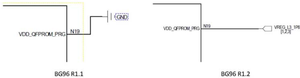
Figure 1: Schematic Designs of BG96 R1.1 and R1.2