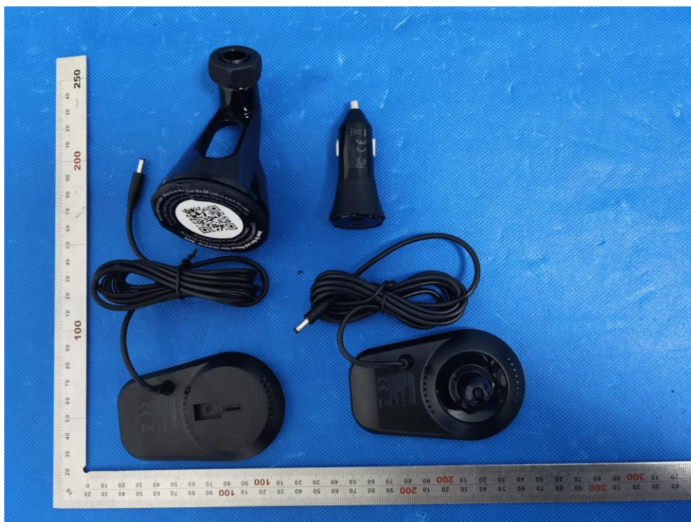
WHOLE VIEW OF EUT(MPQ5DV-XTSP)