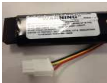
Figure 3. Battery Pack, PN #394-00010

Replace the battery pack with Telular part number 394-00010 only. Use of any other battery type may present a risk of fire.