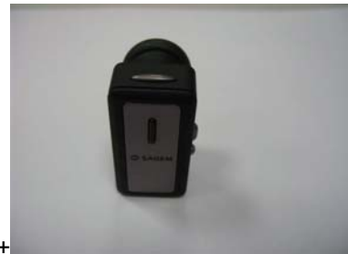
Sagem MyC / MyG and Mini USB Charger