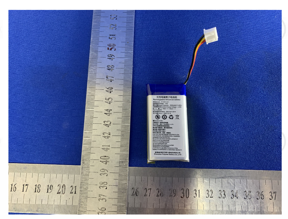
View of Product-19

Report No.: EED32P80251001 Page 55 of 57