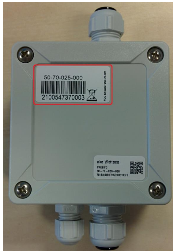
FIGURE 2 - FCC LABEL LOCATION

This label is put on the front of the device, on the casing as it can be seen on the illustration here below.