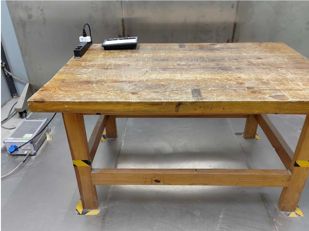
Conducted emissions side View