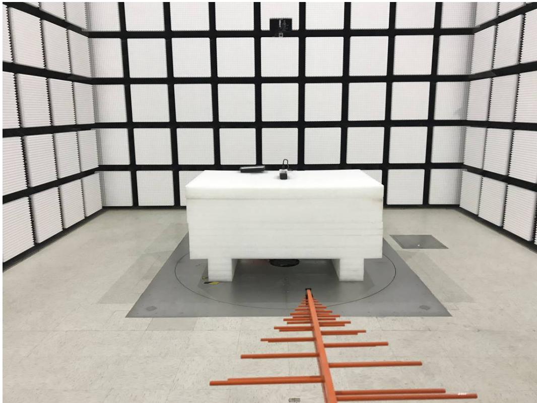
Radiated Emissions Above 1G View