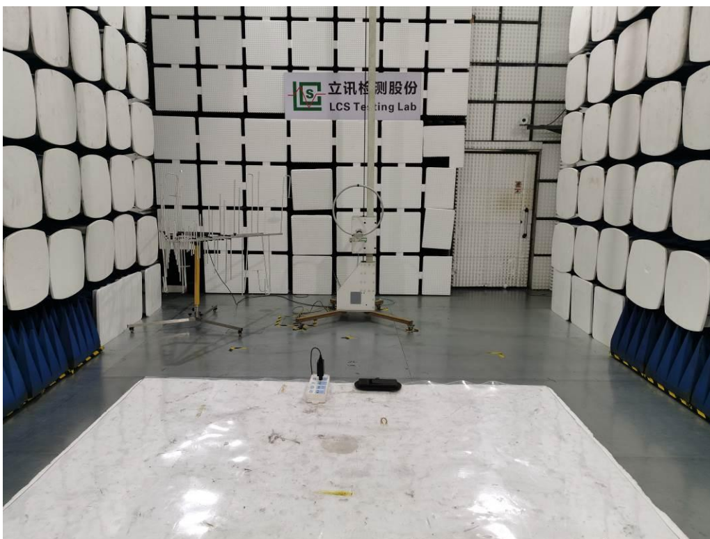
Radiated Emission below 30MHz-AC adapter charge mode