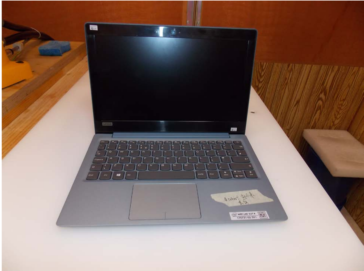
Front of Device