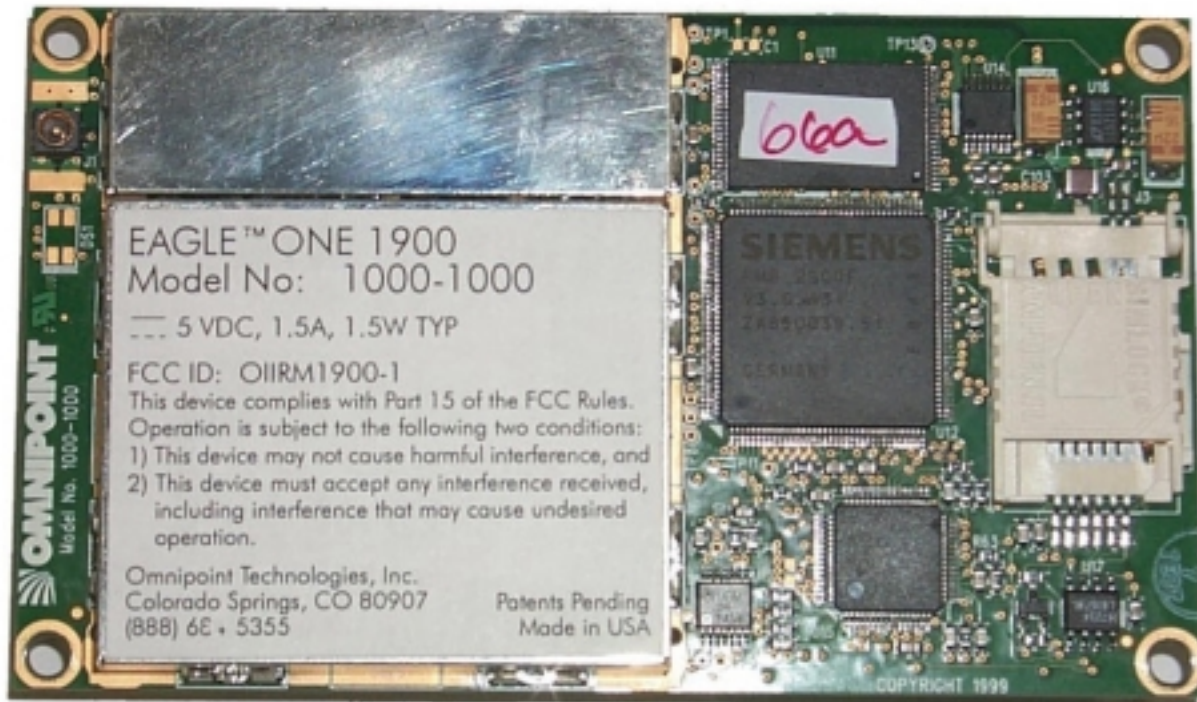
Figure E7.2. Photograph of RM showing FCC Identifier label placement.