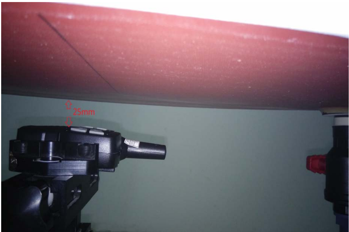
Face-held, the front of the EUT towards phantom (The distance was 25mm)