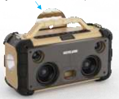
Bright side of CD orient to the front of speaker