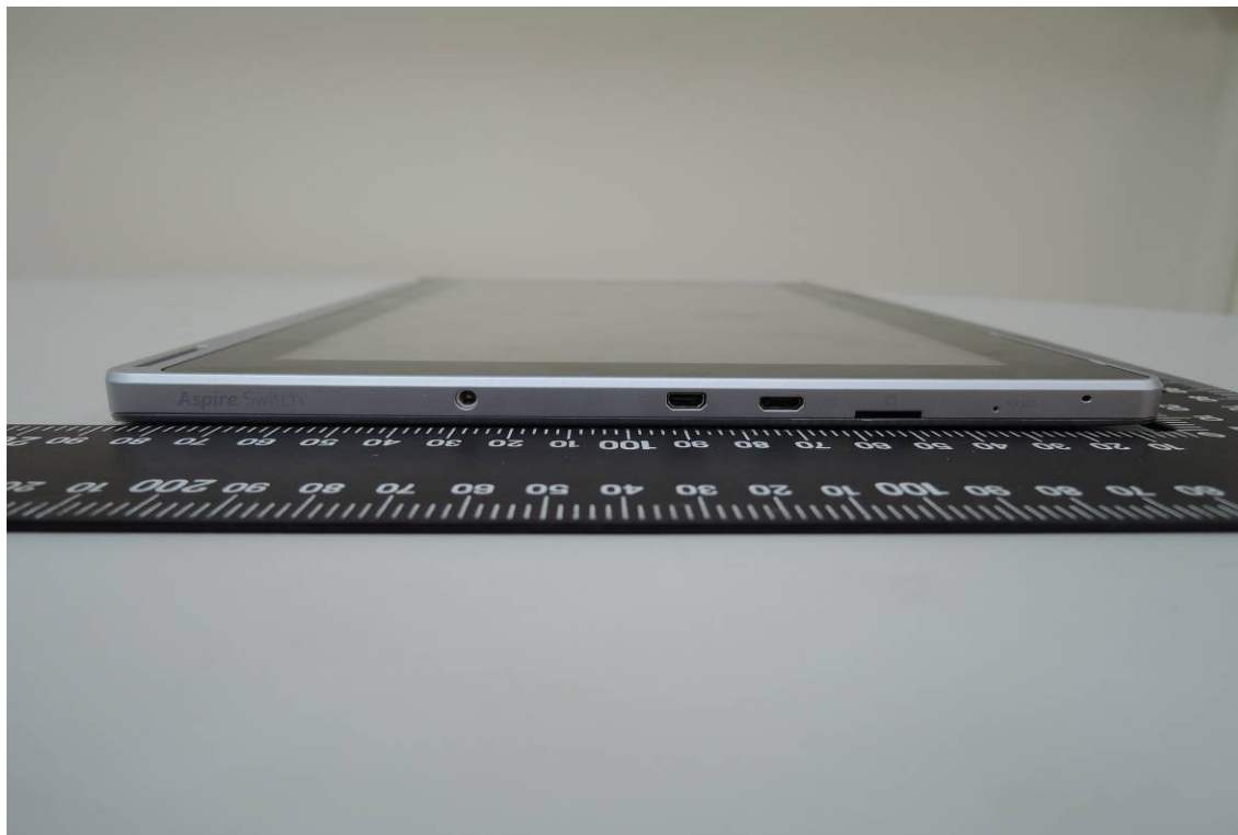
Adapter - 1