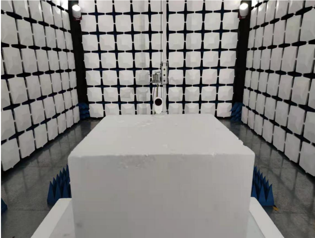
Below 1GHz for radiated emission test setup