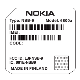
Exhibit 1: Type Label