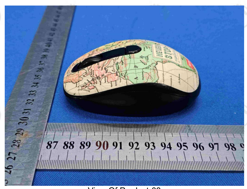
View Of Product-03