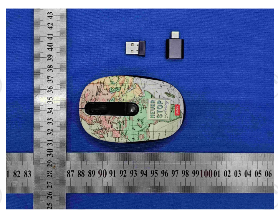
View Of Product-01