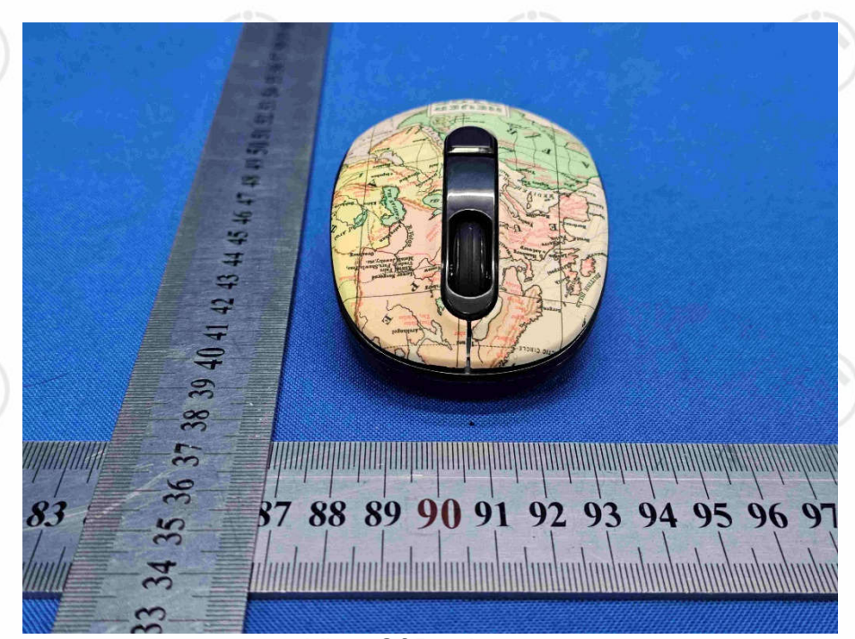
View Of Product-06