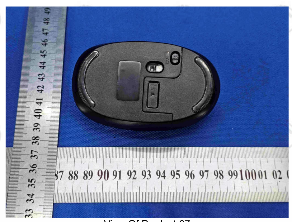
View Of Product-07