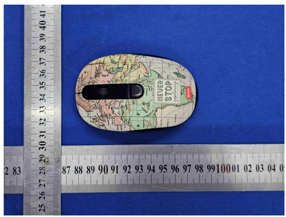
View Of Product-02