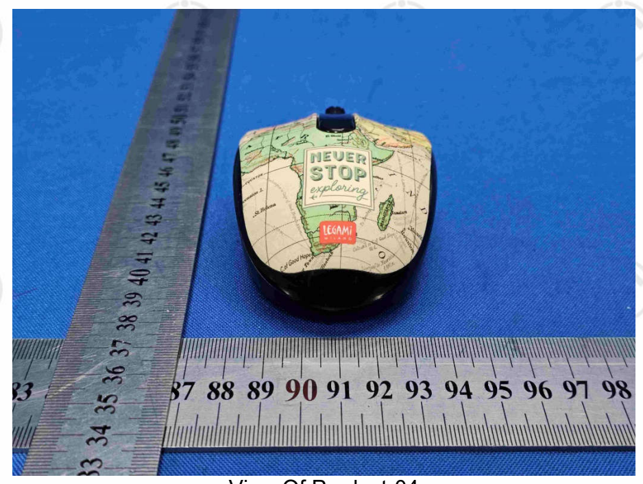
View Of Product-04