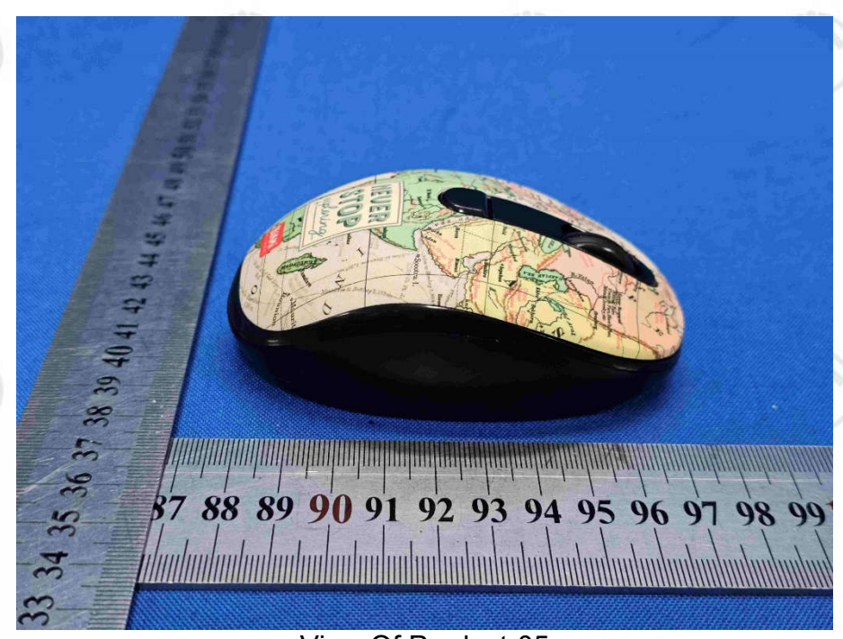
View Of Product-05