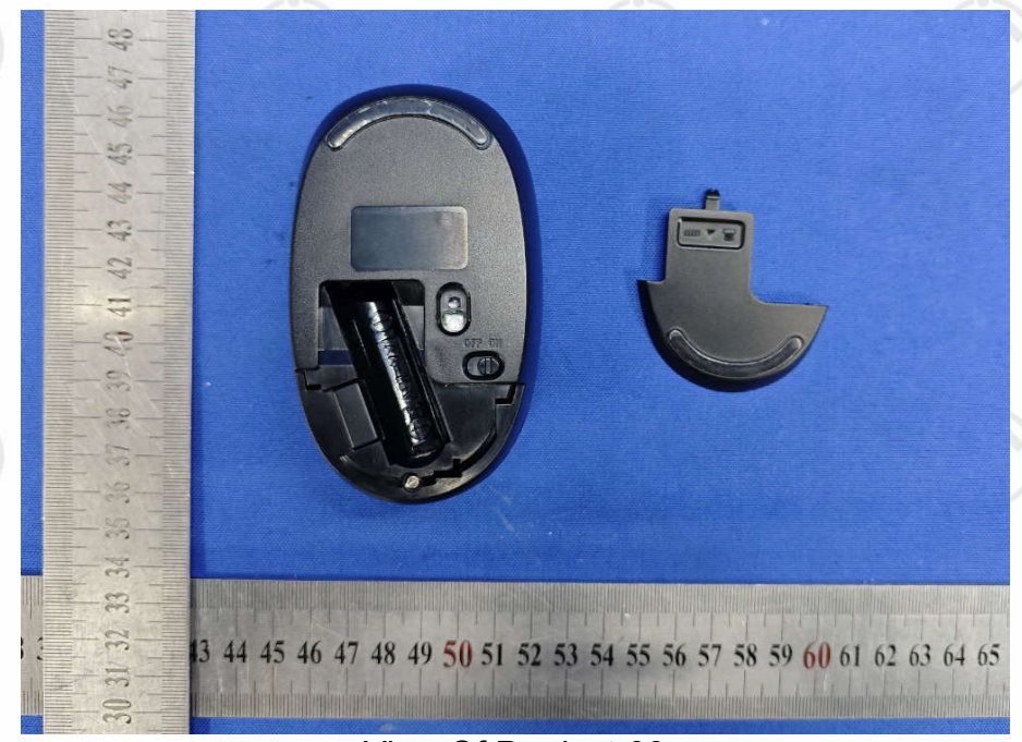
View Of Product-08