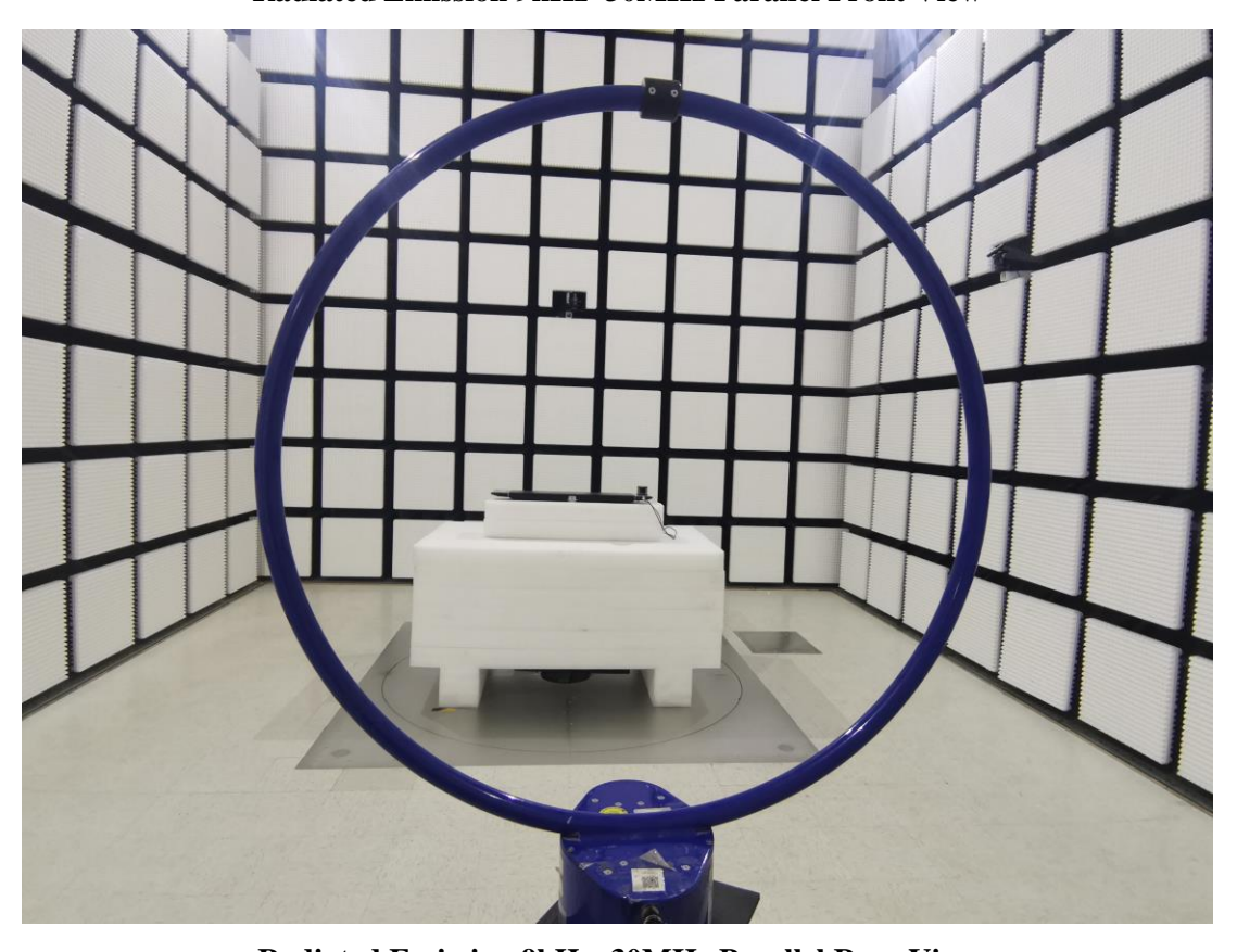
Radiated Emission 9kHz~30MHz Parallel Rear View