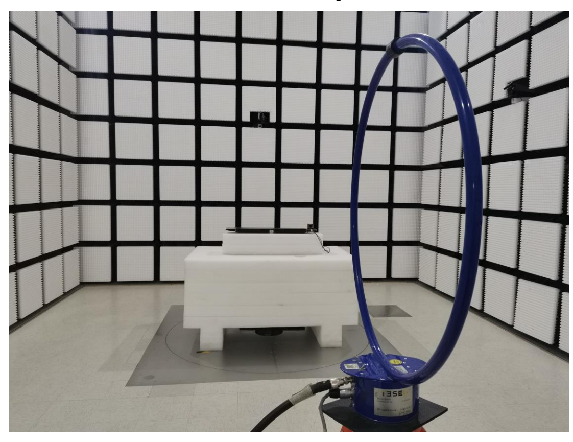
Radiated Emission 9kHz~30MHz Perpendicular Rear View