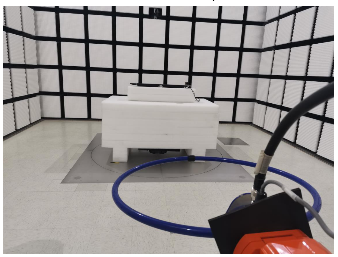
Radiated Emission 9kHz~30MHz Ground-parallel Rear View