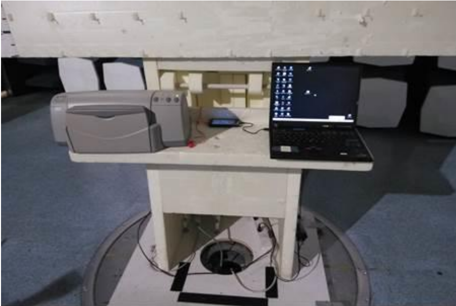
Picture 3. FCC Part 15B Radiated emissions, computer peripherals