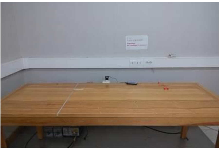
Picture 4. FCC Part 15C AC powerline conducted emissions