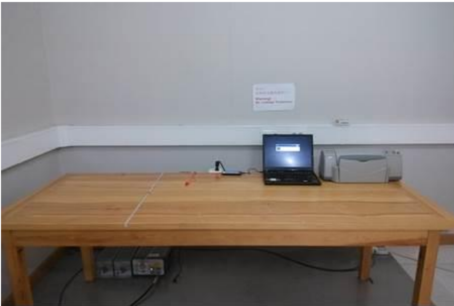
Picture 5. FCC Part 15B AC powerline conducted emissions, computer peripherals, measure from PC charger