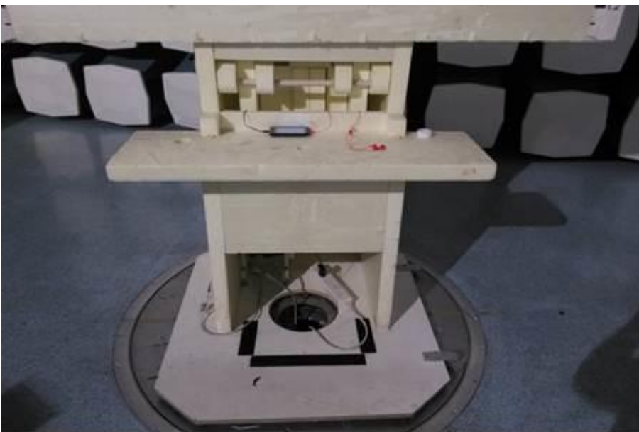
Picture 2. FCC Part 15B Radiated emissions