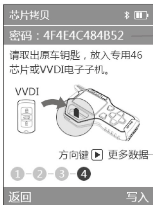
Picture 2.5 Transponder cloning success

Transponder password, or partial vehicle matching password