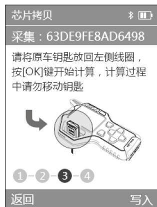
Picture 2.5 Data acquisition success diagram