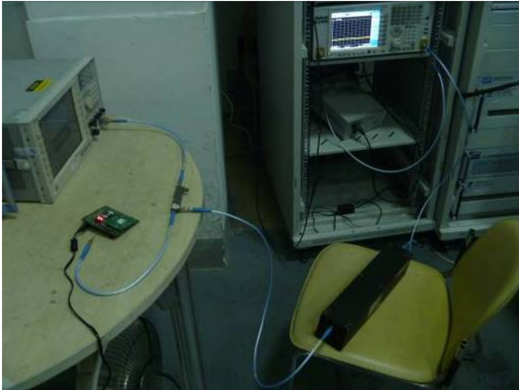
Frequency Stability Under Temperature & Voltage Variations Setup