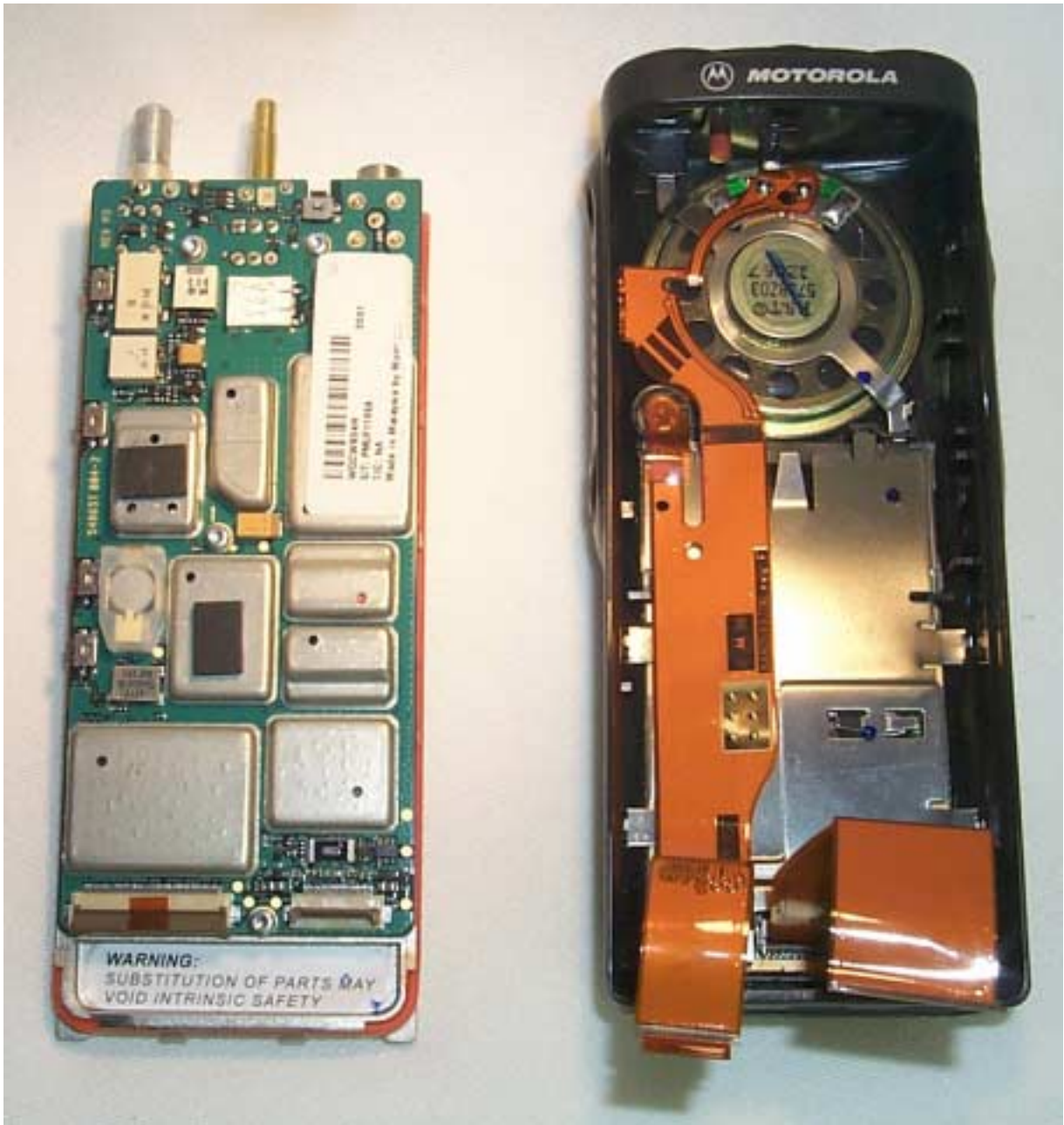
REAR VIEW WITH CIRCUIT BOARD REMOVED FROM HOUSING (MATING SURFACES OF BOARD AND HOUSING ARE SHOWN)