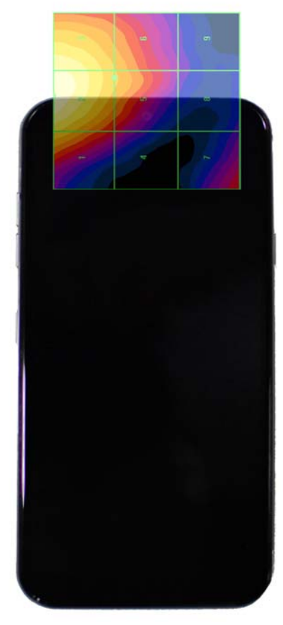
Figure 18-4 E-Field WD Scan overlay