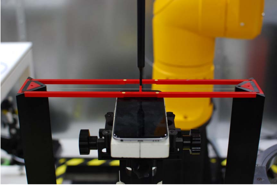
Figure 18-1 Ear Reference Point HAC Phantom Alignment