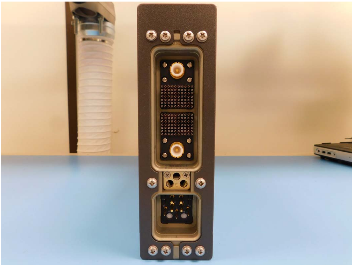
Figure 4: HPA Back View

CONFIDENTIAL, UNPUBLISHED PROPERTY OF ONE OR MORE OF THE FOLLOWING - EMS TECHNOLOGIES CANADA, LTD., FORMATION INC., SKY CONNECT LLC (COLLECTIVELY “EMS AVIATION”).