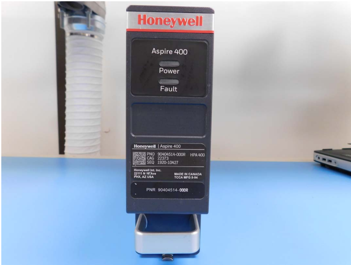
Figure 1: HPA Front View

CONFIDENTIAL, UNPUBLISHED PROPERTY OF ONE OR MORE OF THE FOLLOWING - EMS TECHNOLOGIES CANADA, LTD., FORMATION INC., SKY CONNECT LLC (COLLECTIVELY “EMS AVIATION”).