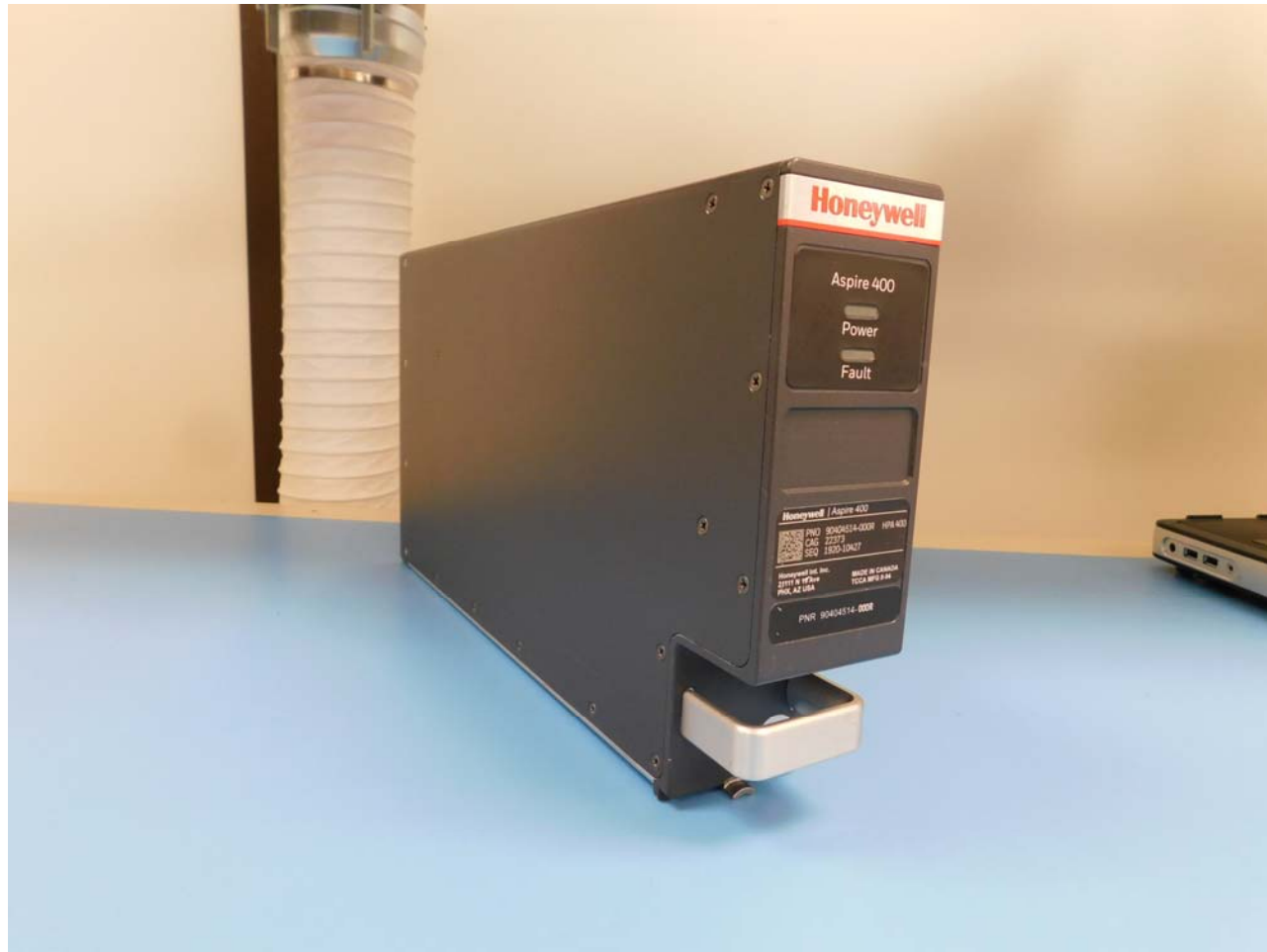
Figure 2: HPA Isometric View

CONFIDENTIAL, UNPUBLISHED PROPERTY OF ONE OR MORE OF THE FOLLOWING - EMS TECHNOLOGIES CANADA, LTD., FORMATION INC., SKY CONNECT LLC (COLLECTIVELY “EMS AVIATION”).