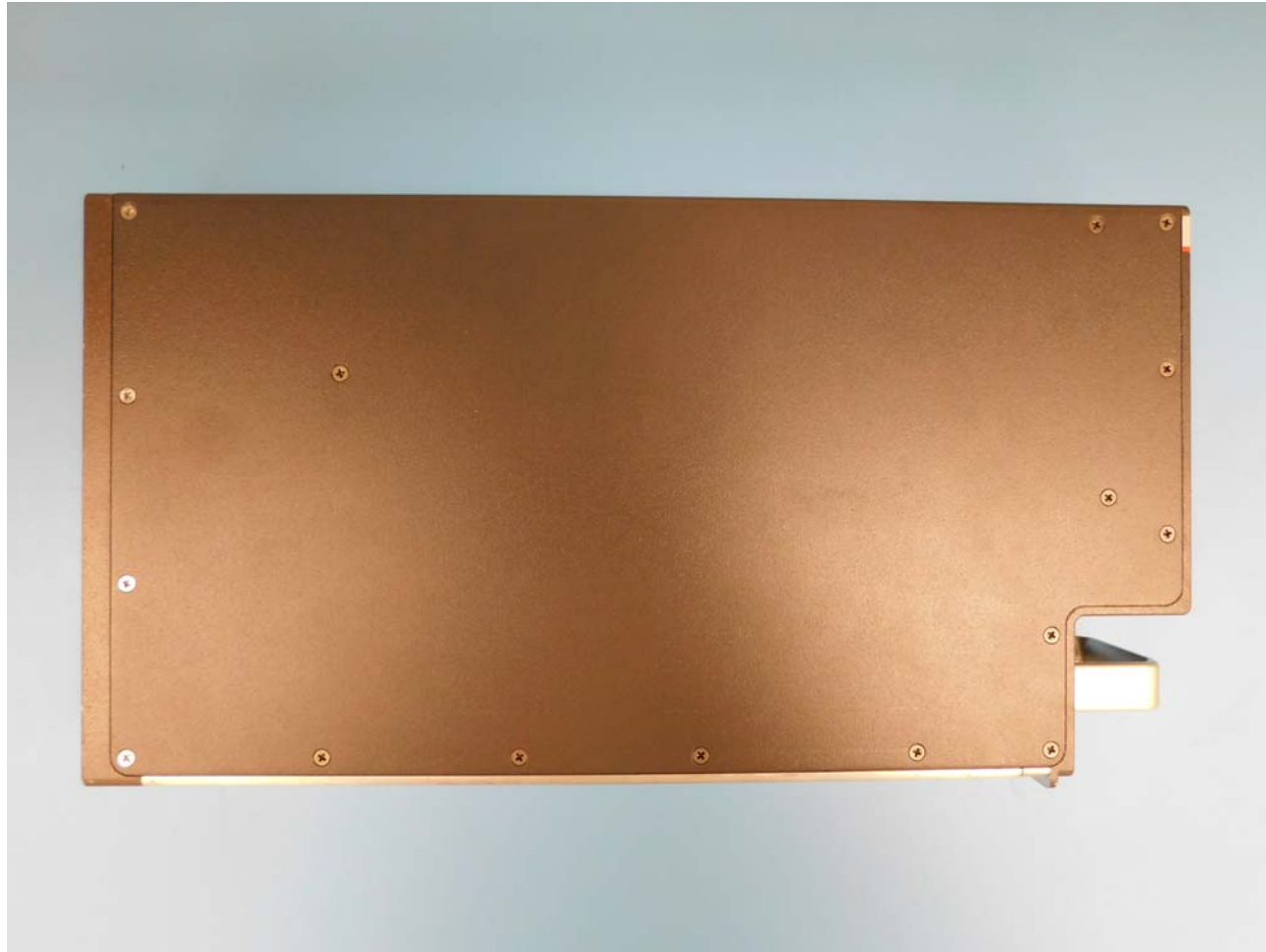
Figure 3: HPA Side View

CONFIDENTIAL, UNPUBLISHED PROPERTY OF ONE OR MORE OF THE FOLLOWING - EMS TECHNOLOGIES CANADA, LTD., FORMATION INC., SKY CONNECT LLC (COLLECTIVELY “EMS AVIATION”).