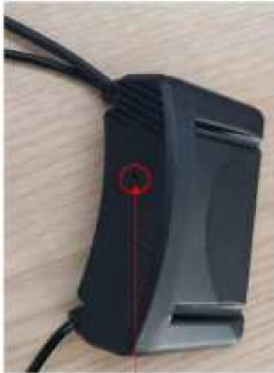
Pinhole Fault Reset Button

If you want to restore the headset to factory default settings, use the Factory Reset in the configuration menu. The headset automatically restores the default settings and turns off.