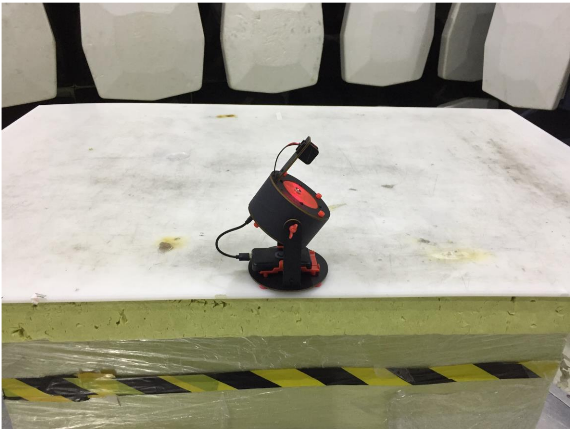
Up to 1GHz (The EUT placed at the center of the turntable)