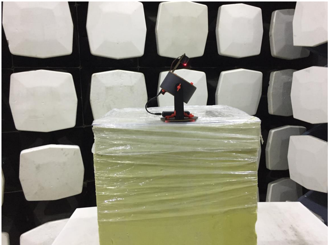
Above 1GHz (The EUT placed at the center of the turntable)