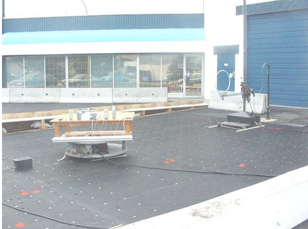
Photograph I.8-1 - Loop Antenna (10kHz - 30 MHz)