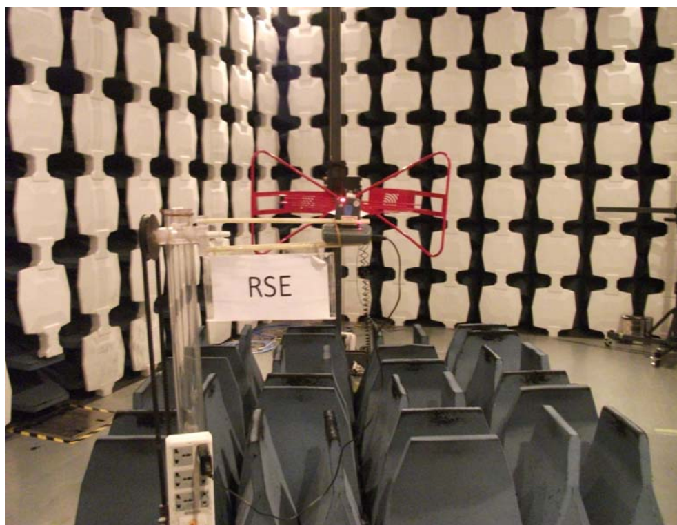
RSE Above 3GHz