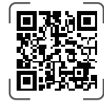
Govee Home App

Contact information: https://www.govee.com/support