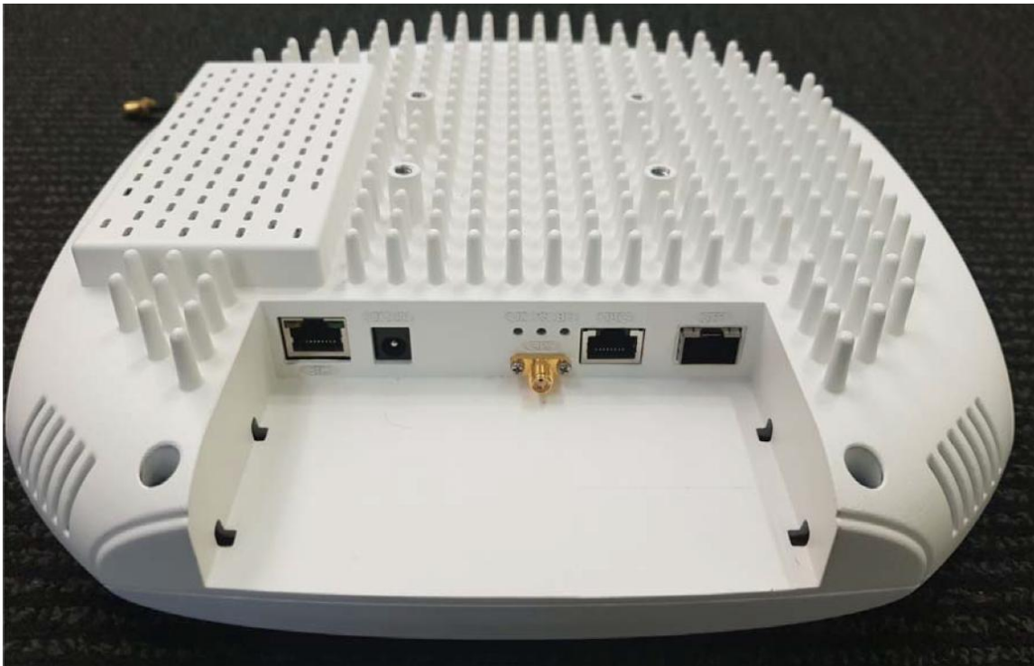
Side View Connector