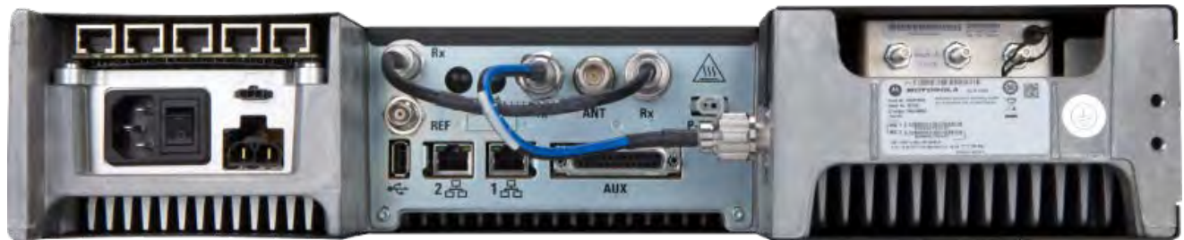
External Back View of Base Radio

EQUIPMENT TYPE: ABZ99FT4098B 109AB-99FT4098B