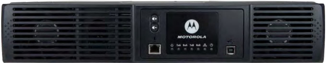
External Front View of Base Radio

EQUIPMENT TYPE: ABZ99FT4098B 109AB-99FT4098B