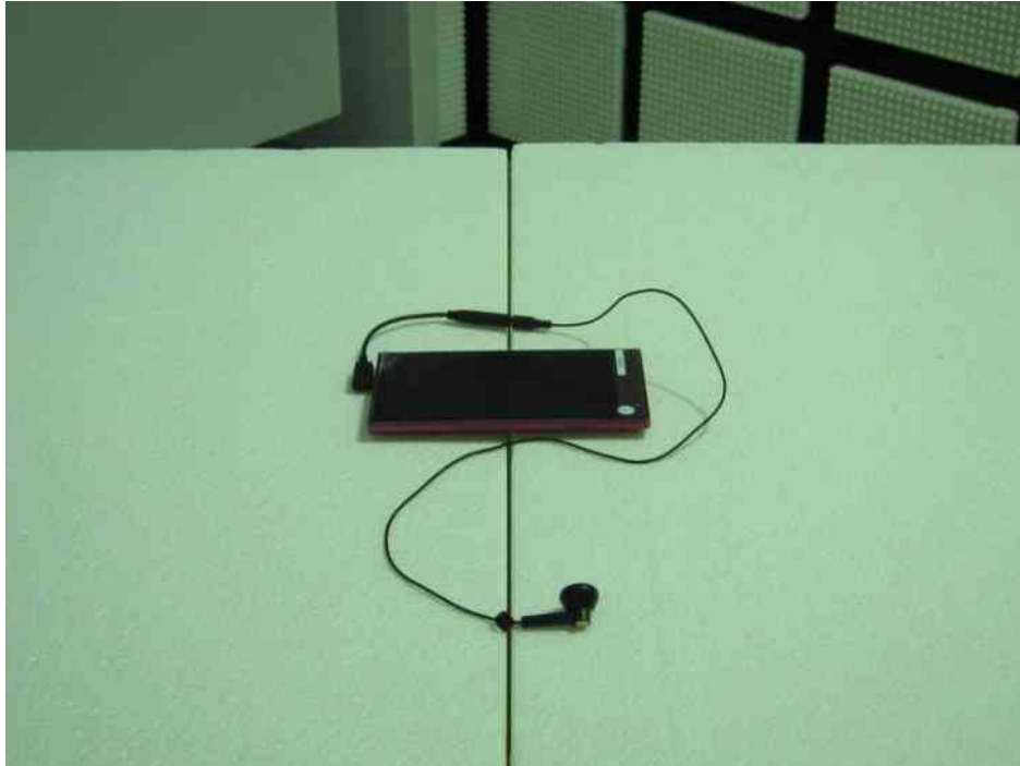
– X-axis –