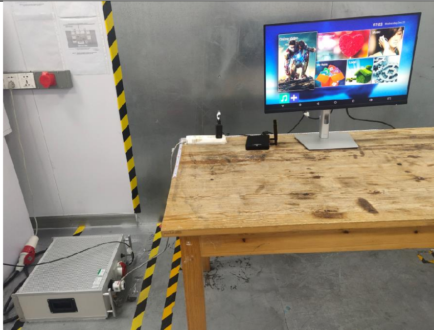
Emissions in restricted frequency bands (below 1GHz)