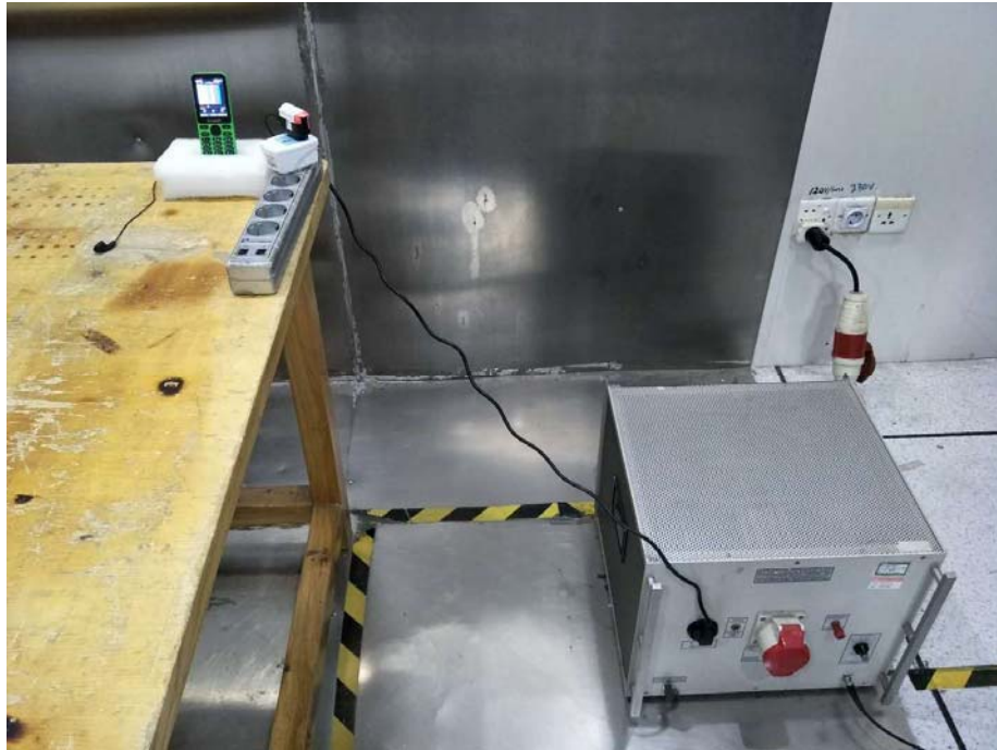
Test Site 1#