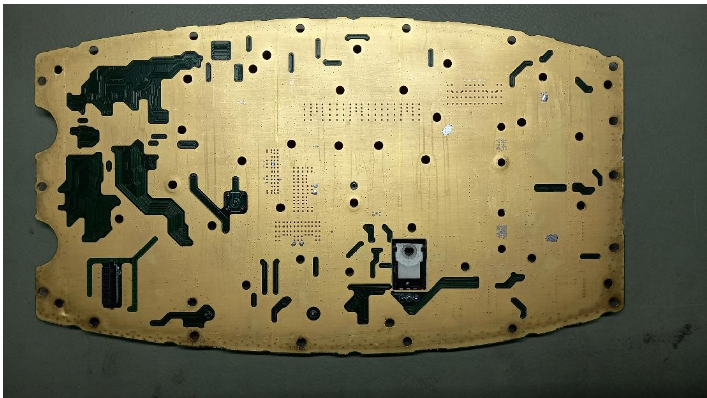
Figure 3: LGA-5005 Main Board – Bottom View