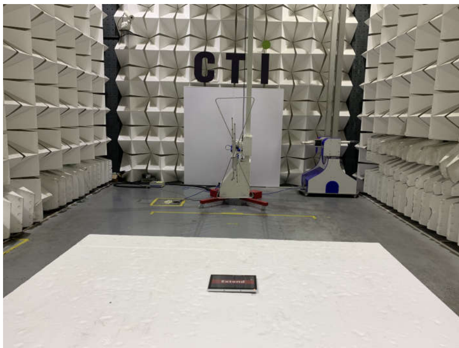
Radiated spurious emission Test Setup-1 (Below 1GHz)