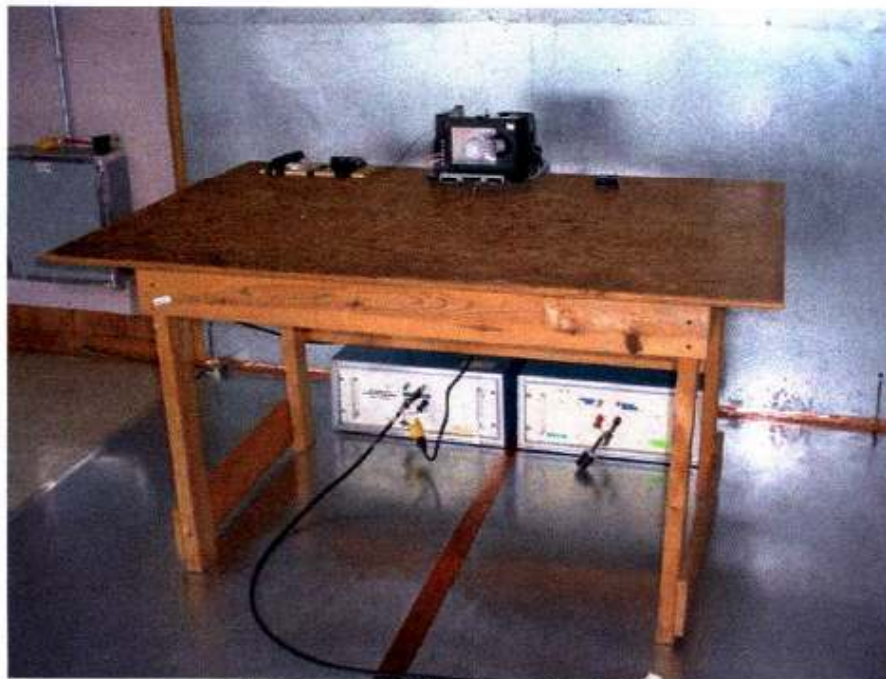
Photograph 2: Conducted Emissions

This report shall not be reproduced, except in full, without the written approval of DTT, Inc.