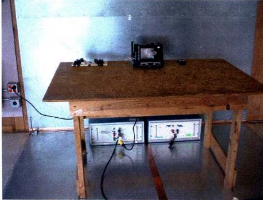
Photograph 1: Conducted Emissions