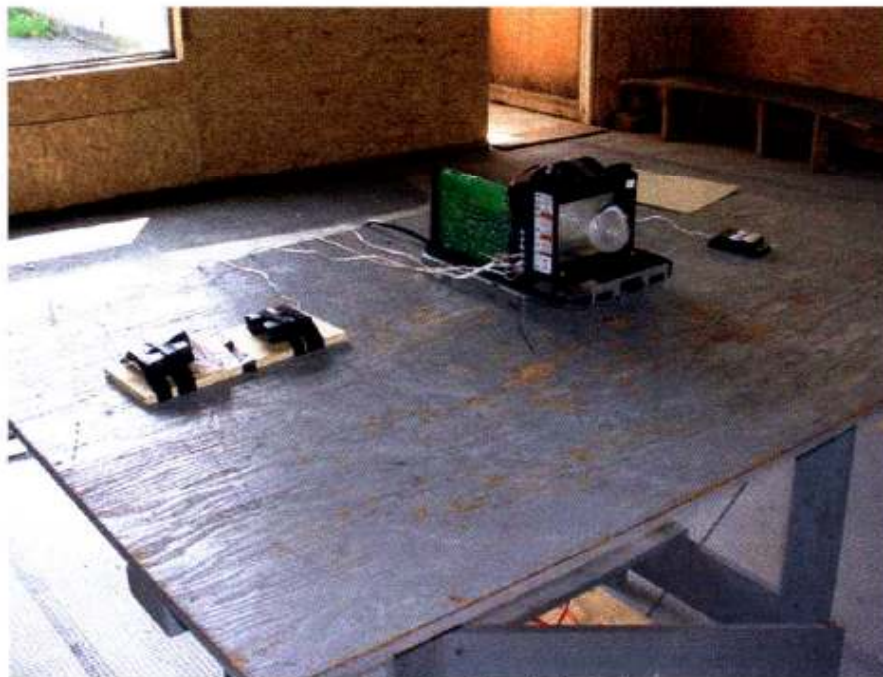
Photograph 2: Radiated Emissions

This report shall not be reproduced, except in full, without the written approval of DTT, Inc.