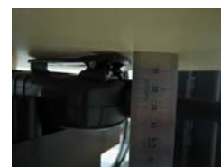
Figure 12. Body SAR