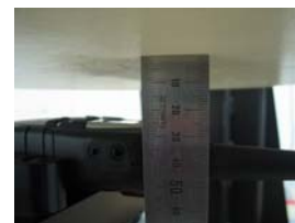
Figure 11. Mouth Face