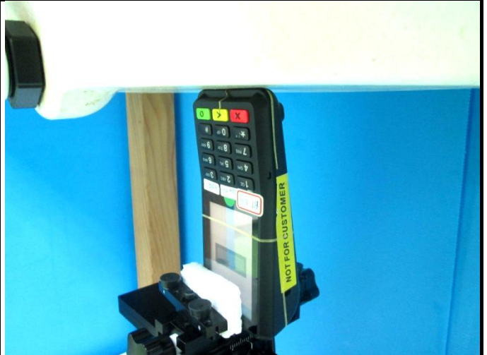
Bottom Side of EUT with 0 cm Gap