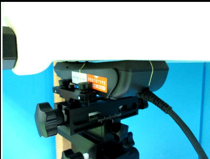
Front Face of EUT with 0 cm Gap