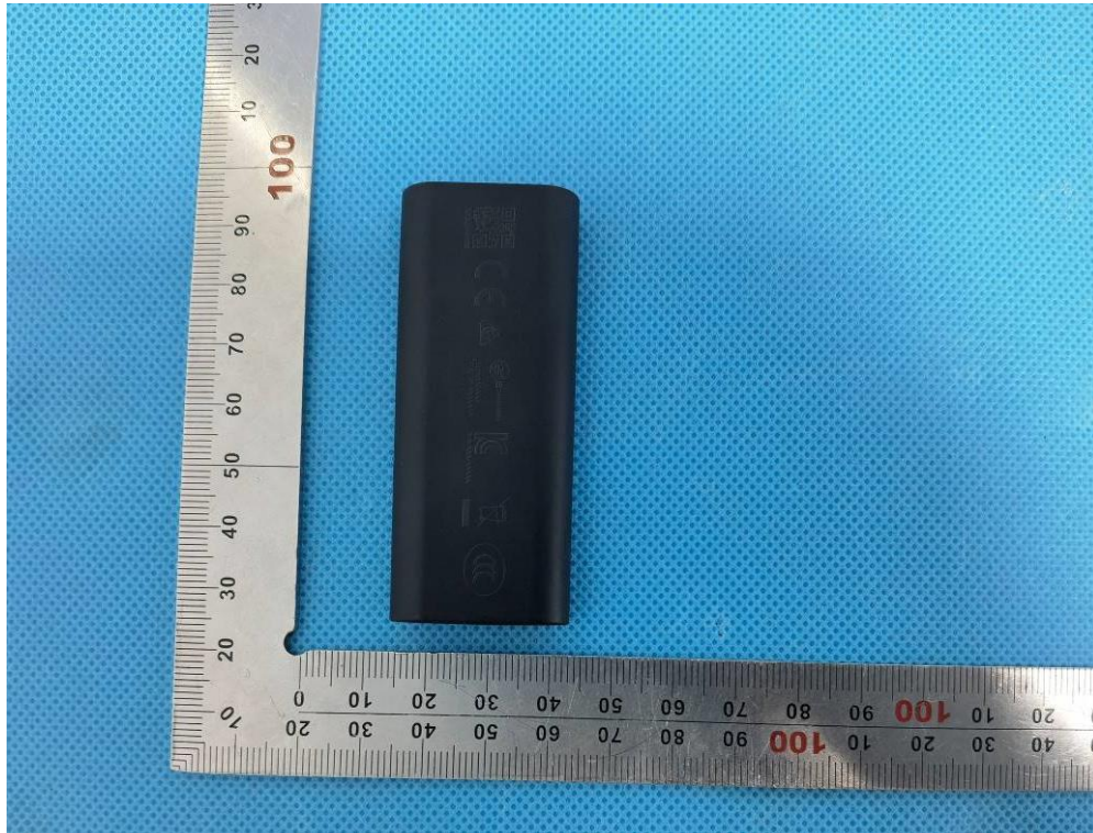
FRONT VIEW OF EUT