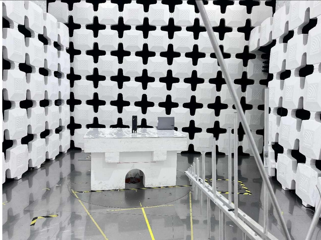
Radiated Emission Above 1G