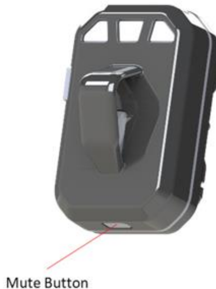
Figure 2-1: SEAL/SEAL-Ex with clip showing the mute button.

Note that the specified button press pattern always triggers a module reset, even during normal operation. The mute button is located on the base of all the SEAL/SEAL-Ex variants as shown below.