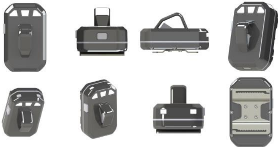
Figure 1-1: The SEAL Wearable GPS Tracker – Clip Variant.

Figure 1-1 and Figure 1-2 below illustrates the clip and the non-clip variants of the SEAL/SEAL-Ex respectively.