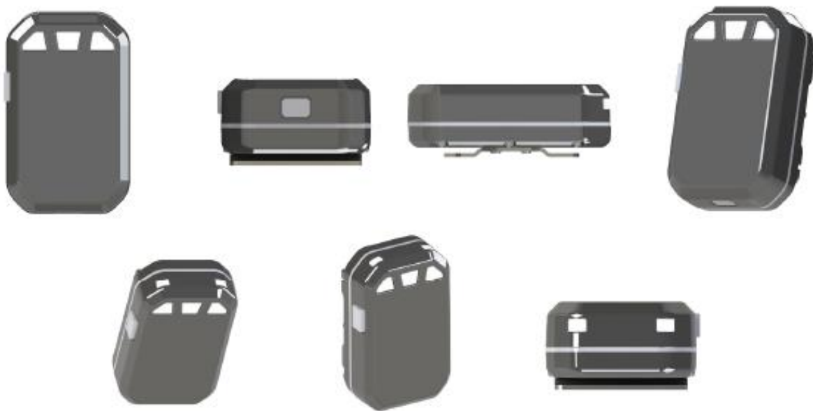
Figure 1-2: The SEAL Wearable GPS Tracker – Non-Clip Variant.