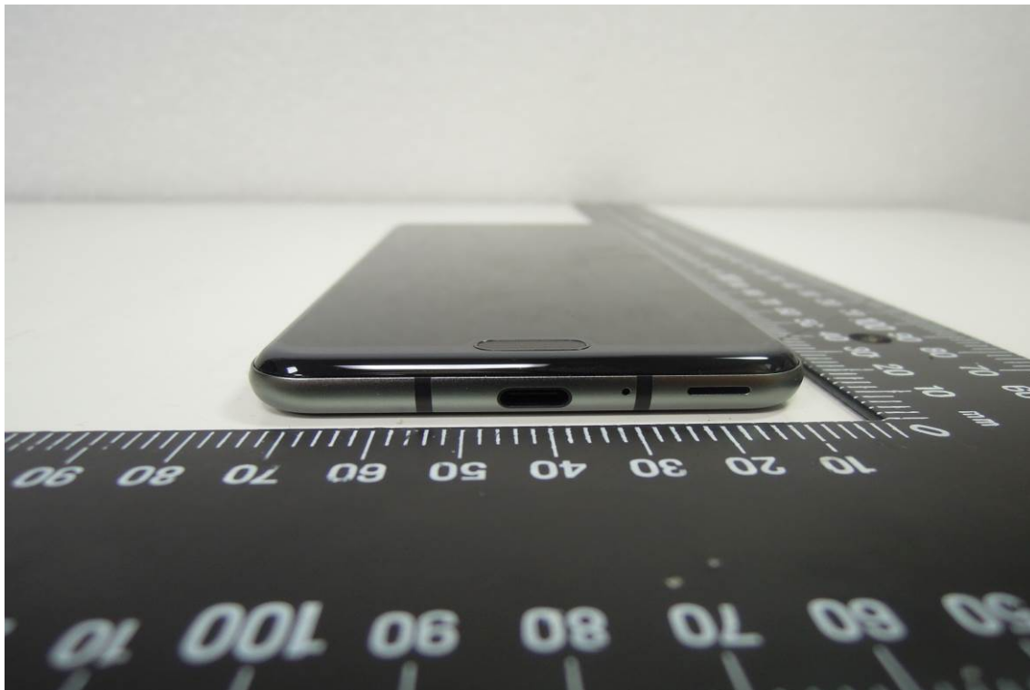
Side View of EUT – 4