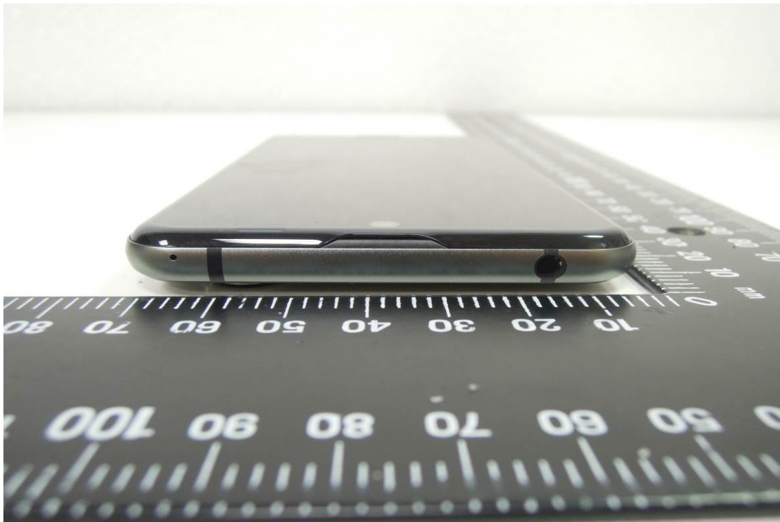
Side View of EUT – 2