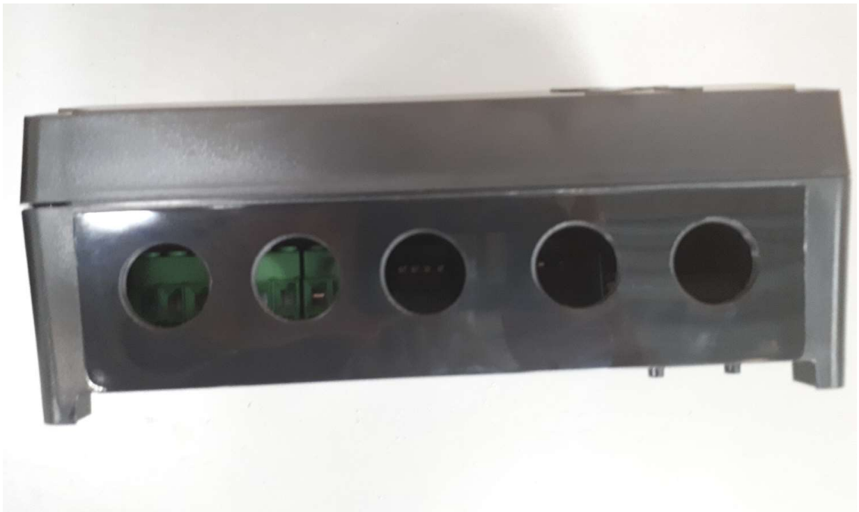
Figure 7 Bottom view of LC 231