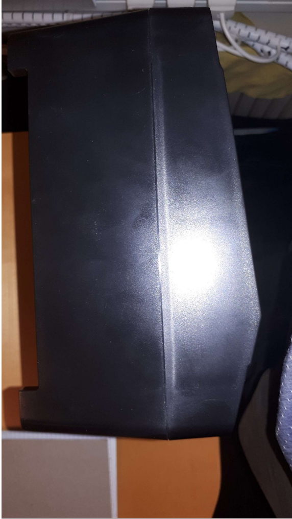
Figure 4 Left side view of LC 231