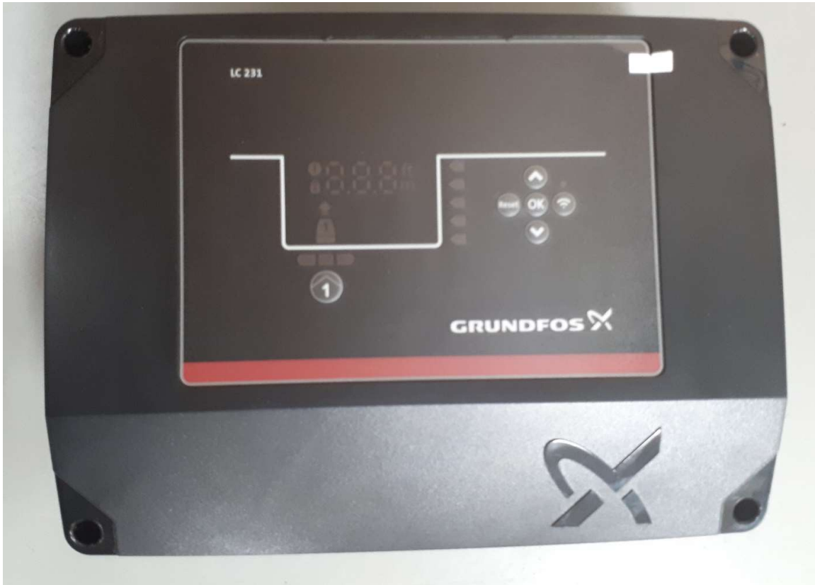
Figure 1 Front view of LC 231 1x1-9.6 DOL PI

Within this document, whenever only LC 231 is mentioned it means that the view is identical for LC 231 2x1-7.6 DOL PI and LC 231 1x1-9.6 DOL PI.