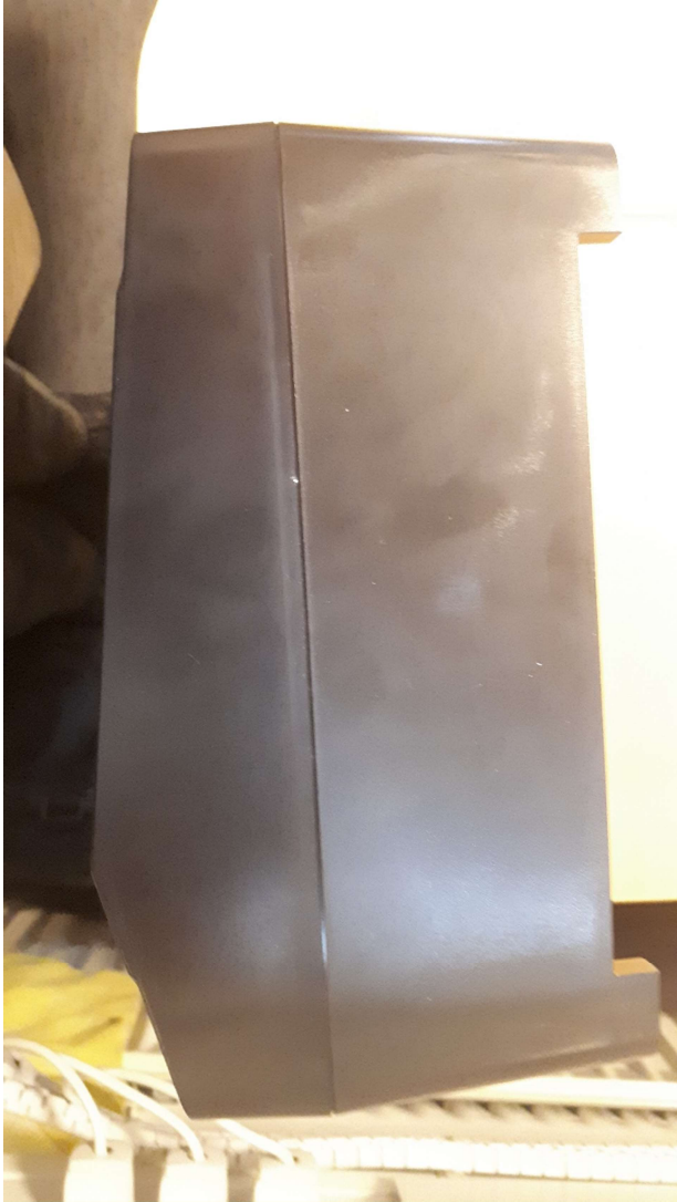
Figure 5 Right side view of LC 231