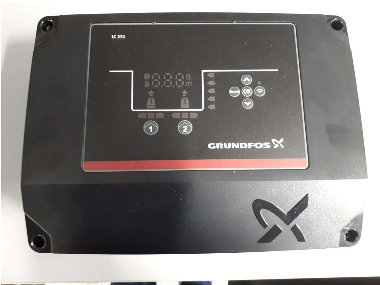
Figure 2 Front view of LC 231 2x1-7.6 DOL PI