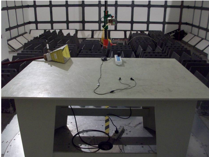
Radiated Emissions (1-25 GHz) – Rear View