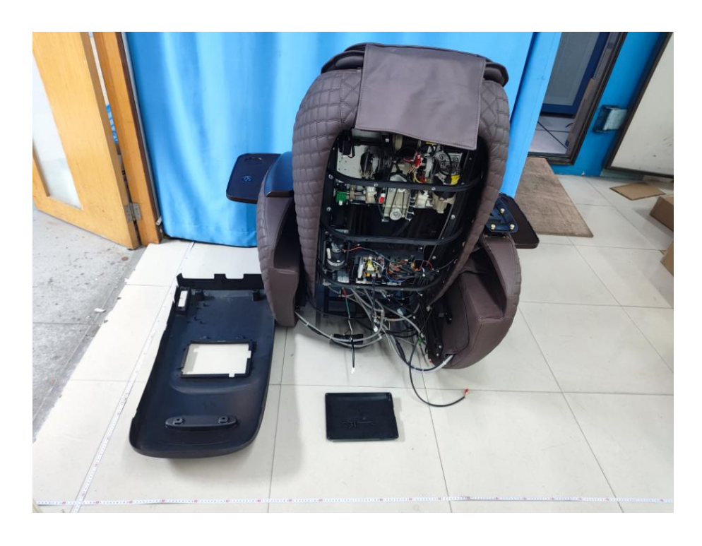
INTERNAL PHOTO OF SAMPLE